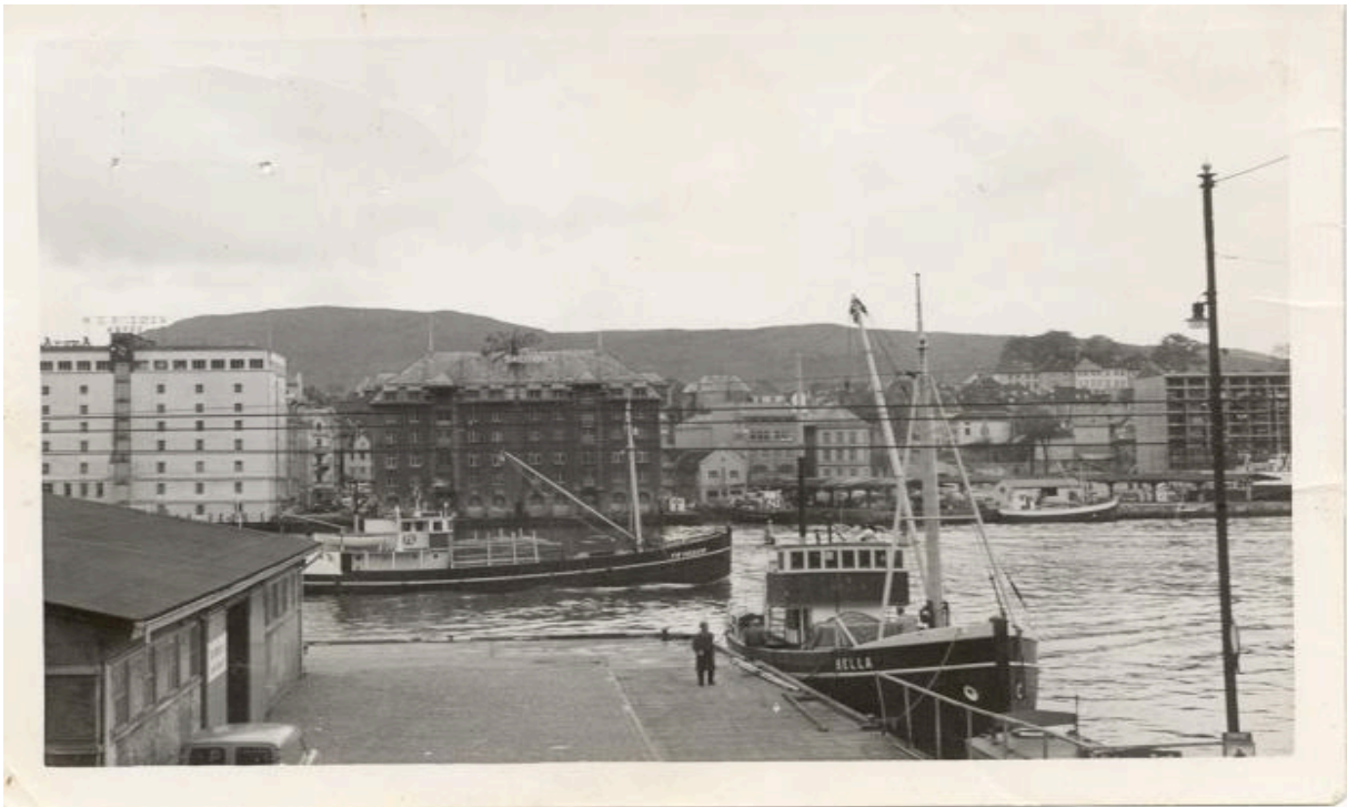
To left «Tryggen» in Bergen, Norway.