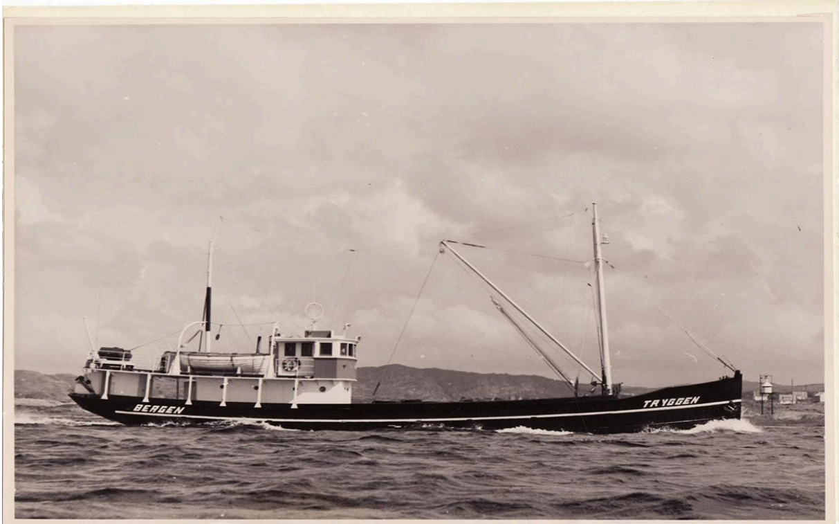
Ex «Sussex County». M/V «Tryggen»